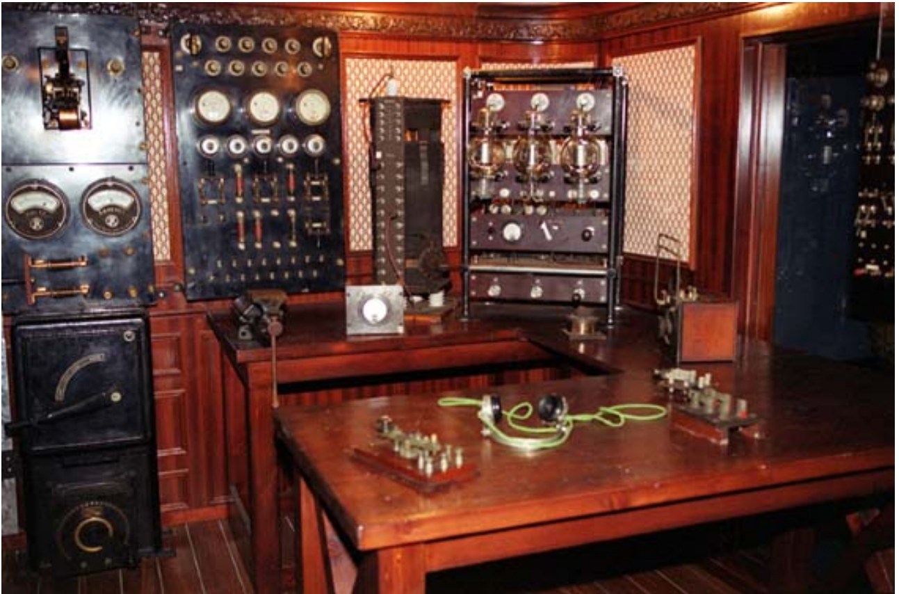
The cabin of Marconi Elettra motorboat rebuilt inside the Telecommunications Museum